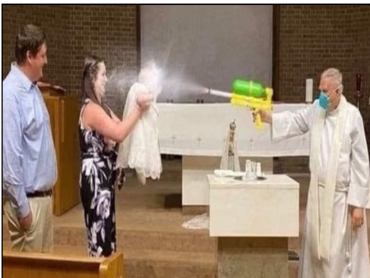
Baptism in the time of COVID-19!